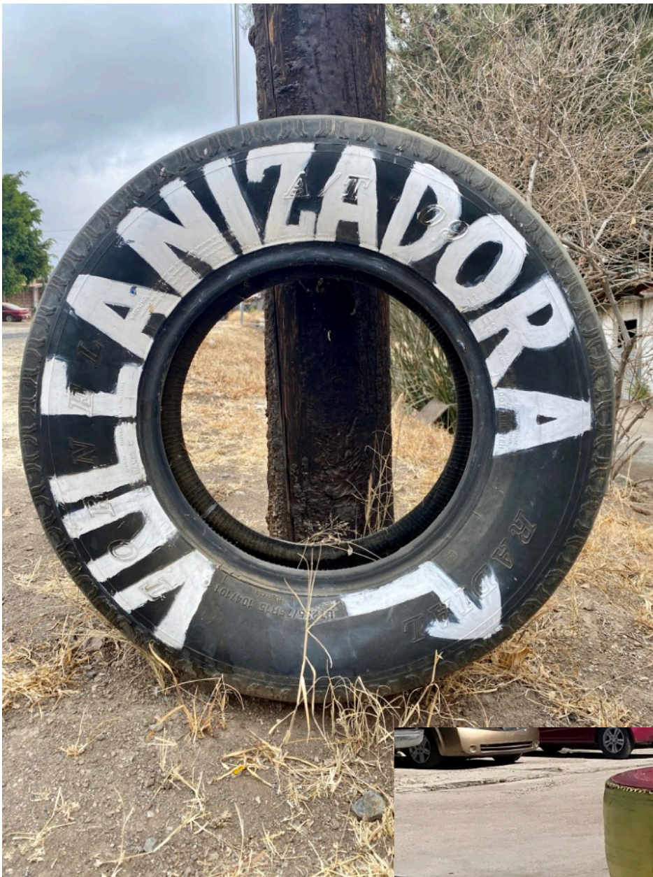
Tyres with text.