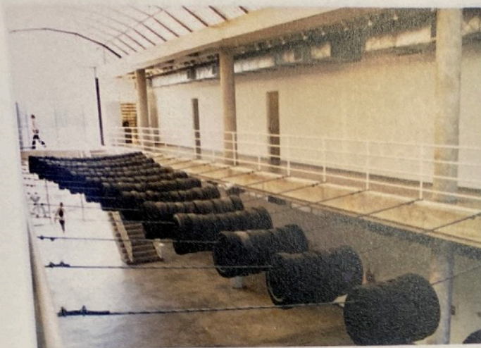
03.06.09 a & b Jack Massing , Tired Sculpture , 1981, site-specific installation at the Glassell School of Art made from tires, braided steel cable and cable clamps. Courtesy Jack Massing.

Jack Massing in January 1981. RGD006N-1984-0100-012 HMRC, Houston Public Library