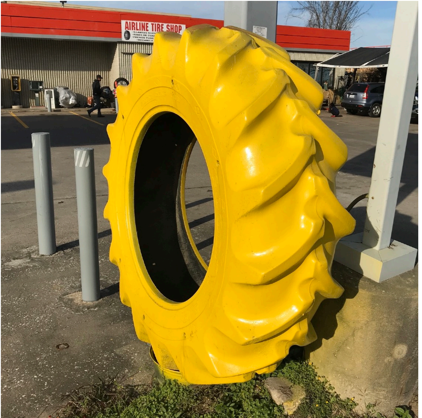
BIG YELLOW TRACTOR TIRE